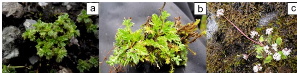
Fig. 2. Photographs of some of the overlooked species records for Peru. a. Aphanes parvula ,